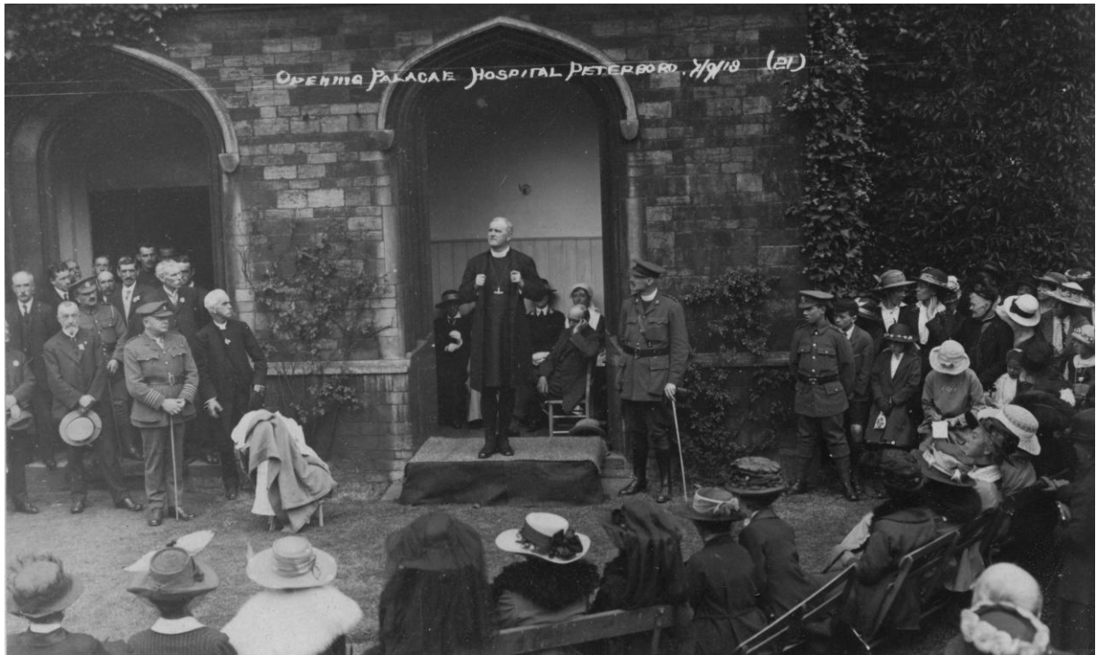
Above, the group facing the camera to the left are standing in the doorway to the Palace.