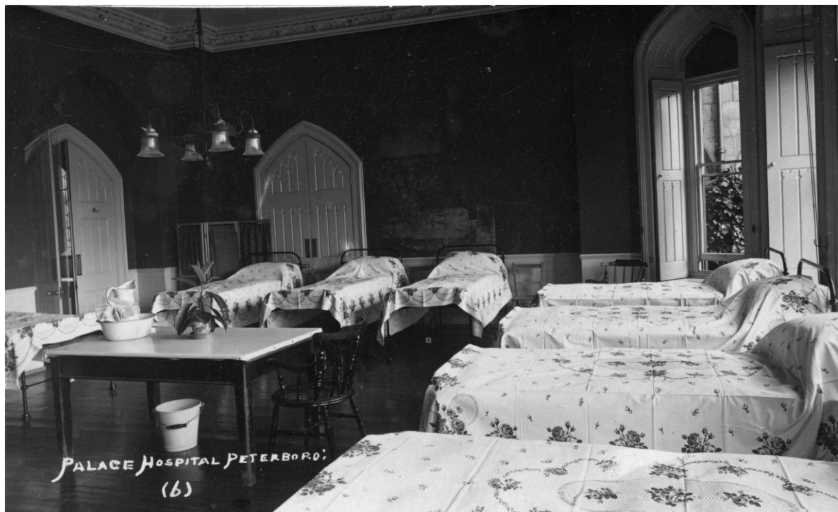
Above, another view of the room in the previous picture