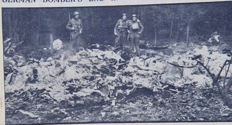
All that remained of a German plane which crashed into a wood on the South Coast after being shot down by a British fighter. It was completely burnt out.