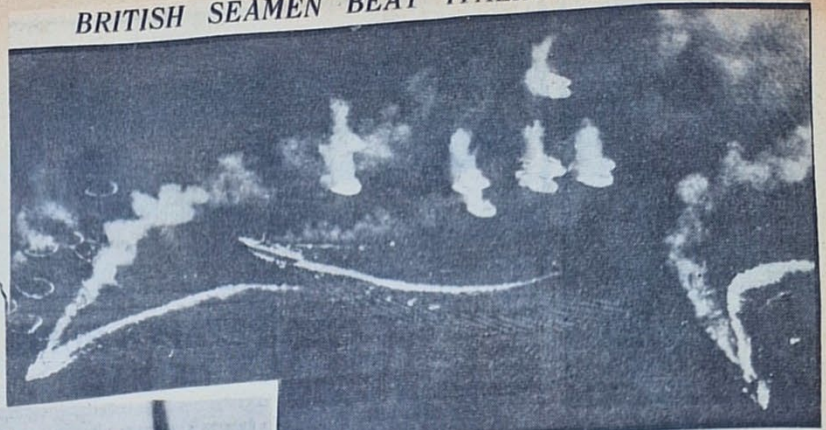
A striking view of an Italian air attack on British ships in the Mediterranean which was successfully avoided by adroit use of the helm.