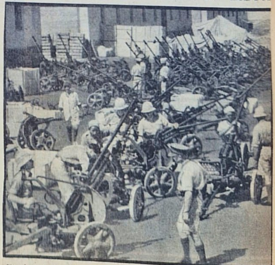
During their penetration into the Libyan desert the British forces wrested large quantities of war material from the Italians. In this picture, one of the first received from the zone of operations, British soldiers are seen inspecting piles of light anti-tank guns which had failed to check the armoured cars moving against them.