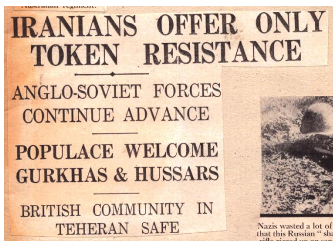
The Times August 27 th 1941

The Anglo-Soviet invasion of Iran , also known as the Anglo-Soviet invasion of Persia , was the joint invasion of the neutral Imperial State of Iran by the United Kingdom and the Soviet Union in August 1941. The two powers announced that they would stay until six months after the end of the war, which turned out to be 2 March 1946. On that date the British began to withdraw, while the Soviet Union delayed until May, initially citing "threats to Soviet security", followed by the Iran crisis of 1946.