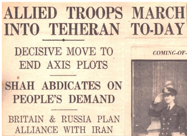
The Times September 17th 1941